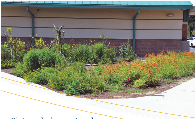
Pictured above: Landscaping with natives at Lyonia Environmental Center including: Blanket Flower ( Gaillardia pulchella ) and Dune Sunflower ( Helianthus debilis )